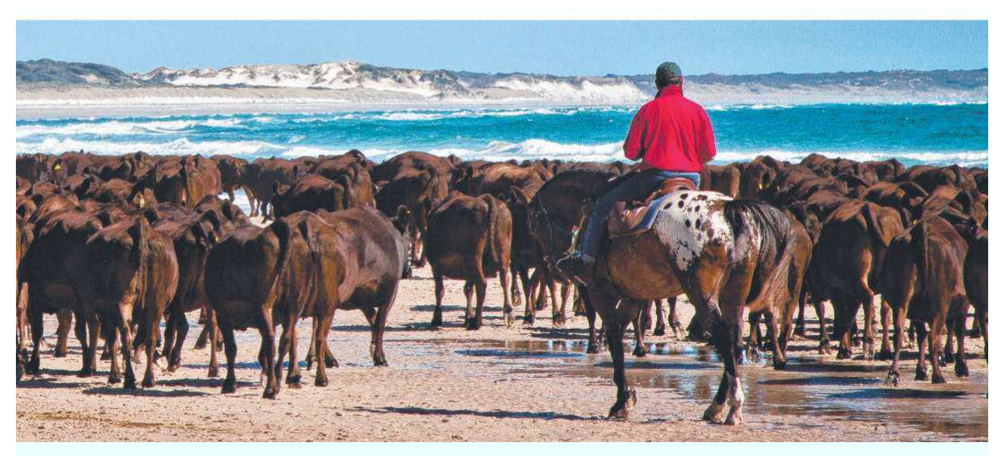
Beef and reef: The Hammond brothers herd their Wagyu cattle between Robbins and Walker islands off Tasmania's northwest coast to graze on the sand dune vegetation and seaweed.